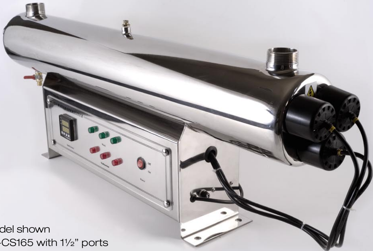
model shown UV-CS165 with 1½" ports